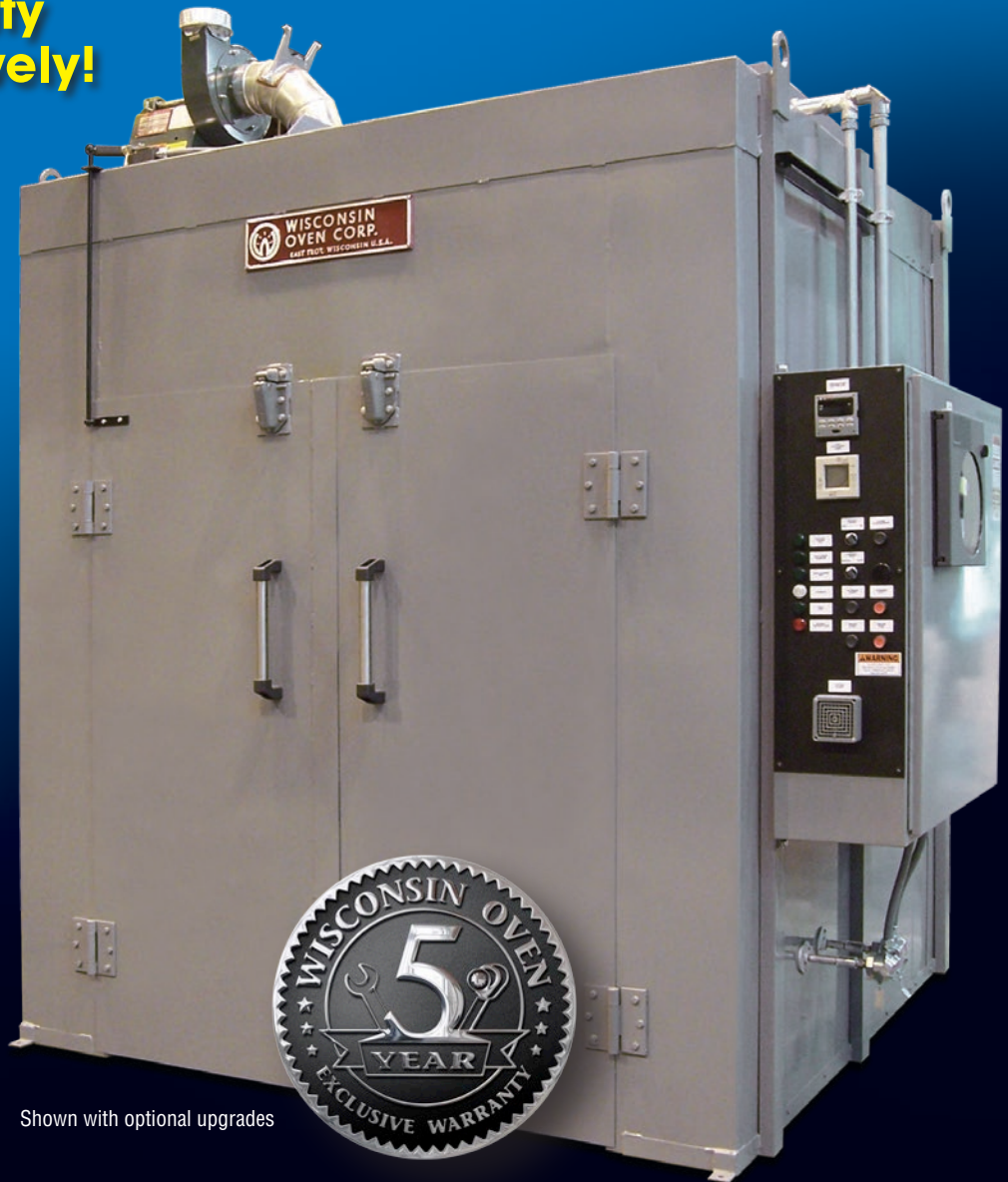
Shown with optional upgrades

2675 Main Street • PO Box 873 • East Troy, WI 53120 USA www.wisoven.com • sales@wisoven.com • 262-642-3938