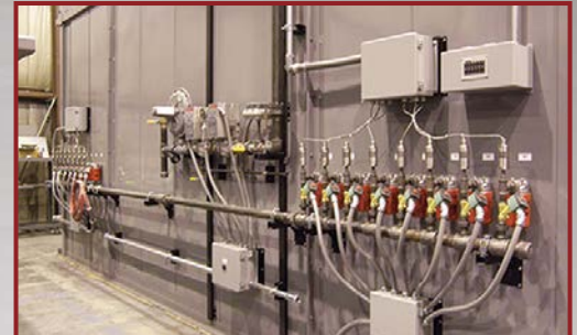
Vacuum Piping System with Pressure Transducer and Thermocouple Jack Panel