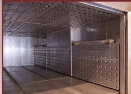
Interior Supply and Return Ducts with Interior Lighting