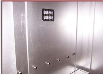
Interior Thermocouple Jack Panel and Vacuum Stubs