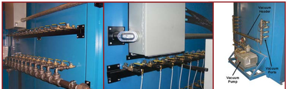
Vacuum Lines for Composite Bag Applications